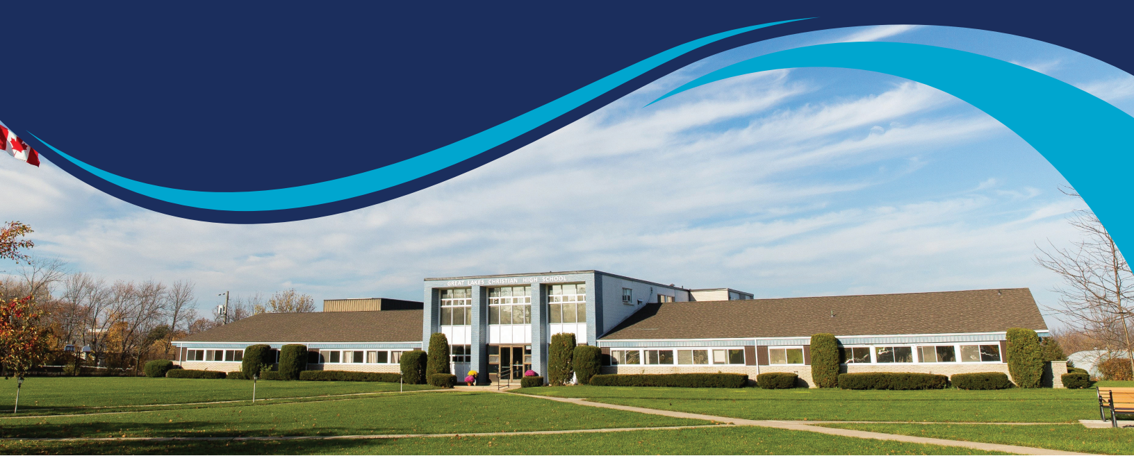
Photograph of Ellis Hall today.