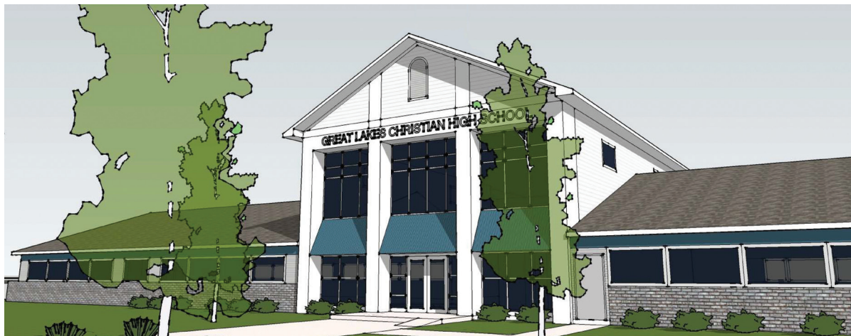
Architect's drawing of the design for the new façade, entry, and central hall.